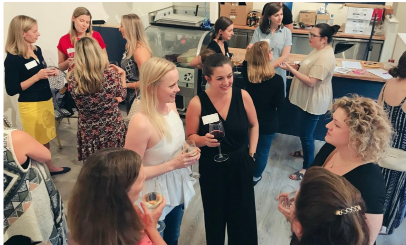
A memorable evening together at Bond Street Wines in 2019.

Look for information coming soon about an end-of-the-year event being planned for May. We are working out the details, but chapter officers will be installed at this time, so you won't want to miss it!